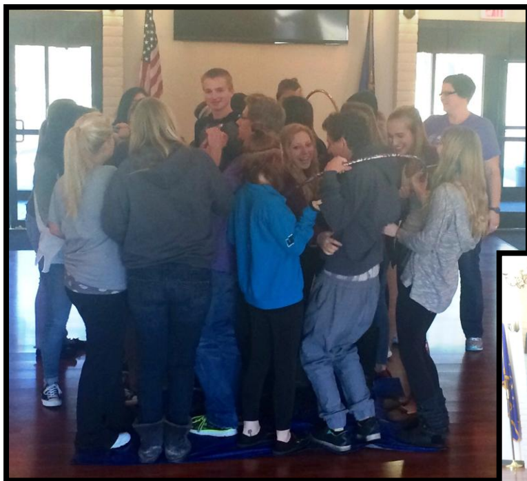
Pictured: Dental students involved in a shipwreck challenge.